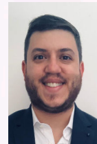
Administrative Assistant Collaborates in the coordination of loads.